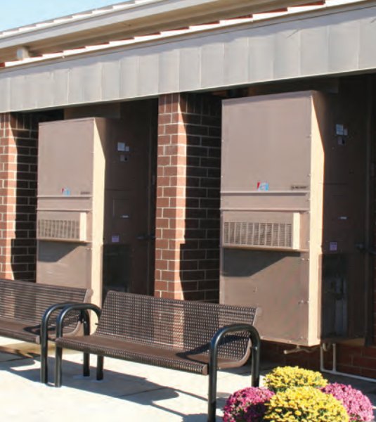
Bard's Quiet Climate 2 units were incorporated into the architects overall design for the new school.