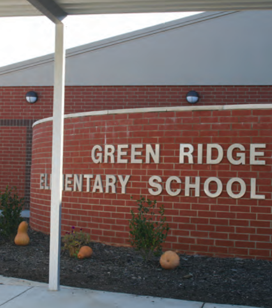
Green Ridge Elementary School in Biscoe, North Carolina.